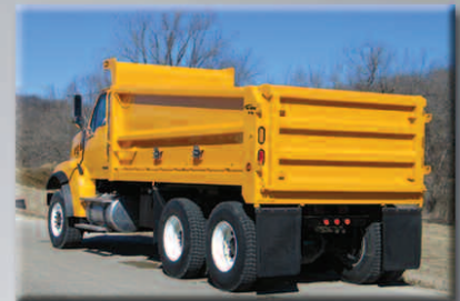
PS400 Premier Series Dump Body