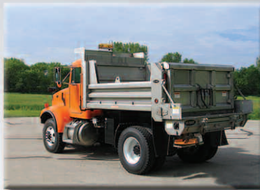
PS350 Premier Series Dump Body