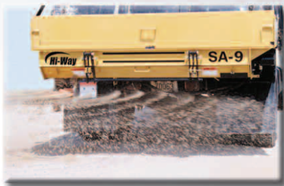
SA-9 Tailgate Spreader